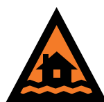
Watch and Act